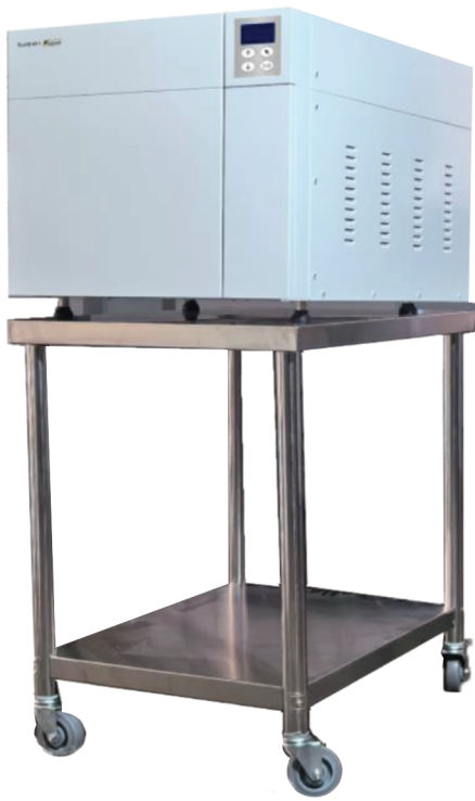
Trolley Included with Each Unit